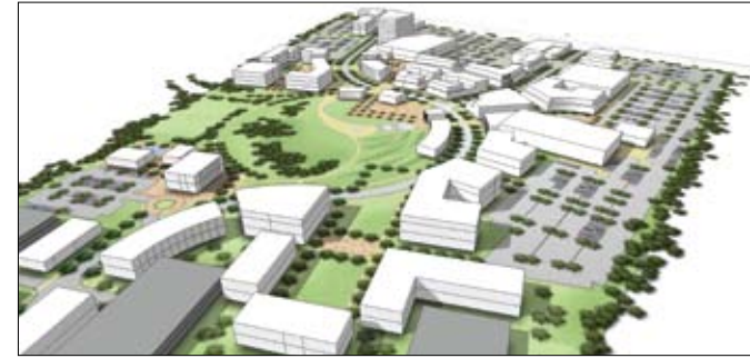
illustrative plan model mexico client : confidential

Through a series of internal, collaborative work sessions, we develop a detailed design package to solicit reaction and encourage suggestions from our clients. Our flexibility and open communication make certain that the vision is respected and the project budget stays on track as we set the stage to produce a comprehensive set of construction documents. As tenants begin to express interest in joining the project, we produce the exhibits and marketing pieces that are crucial to getting leases signed and attracting other prospects.