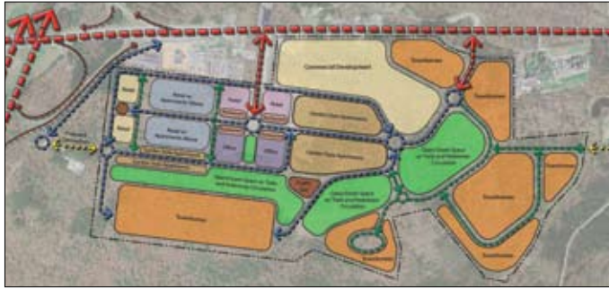
mixed use project northeast united states client : confidential

We understand that, without a practical approach to determining its feasibility, a "vision" is nothing more than just that. Kick-off meetings with our clients establish project goals, programming, and design direction, followed by a due diligence process to ensure that these objectives can be met. Aided by our years of experience in retail and commercial markets, our clients have come to rely on our swift delivery of initial site diagrams and yield studies that provide accurate and valuable information for their pro formas.