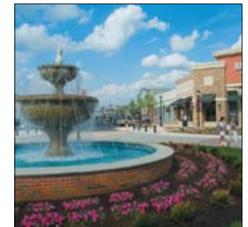
promenade shops at saucon valley lehigh valley, pa client : poag & mcween lifestyle centers, llc