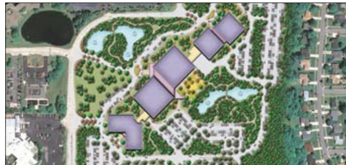
allen-bradley mayfield heights, oh client : rockwell automation corporate campus

A green light sets into motion the entitlements process necessary to bring a project to a community. Investment and buy-in from the public sector requires a sensitive approach that begins with work sessions with municipal staff to establish mutual objectives and common ground. We represent our clients' interests with confidence and sell the benefit of their vision to local ordinances, while clearing hurdles along the way. Our effective illustrative materials and seasoned presentation style assure success with the public sector, even when faced with the most outspoken of citizens.