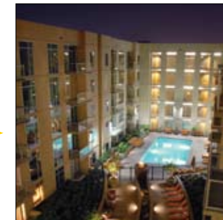
icon in the gulch nashville, tn client : bristol development group and marketstreet equities co.

With countless built projects in our portfolio, we are a proven leader in construction services. Our knowledge and technical expertise are invaluable when interpreting bids and negotiating with contractors. During construction, our thorough project observation and detailed field reports assure our clients that their project is being held to a high standard of quality. Quick responses to contractor requests for information, change orders and pay requests ensure a timely opening and a smooth road to reality.